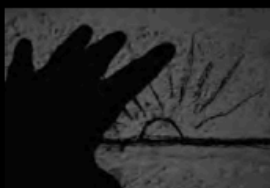
Cover image: Jhafis Quintero, Hombre que camina , (video still) 2013, Collection: Mona

Please note this exhibition contains mature themes and content that may not be suitable for younger patrons.