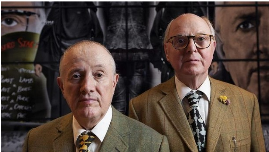
Gilbert & George: "We have a church at one end of our street and a mosque at the other end and we are the secular non-believers in the middle."

"It was extraordinary, when we were baby artists and hardly known," George says of their first visit to Australia. "It became part of our history and part of Australia's history as well."