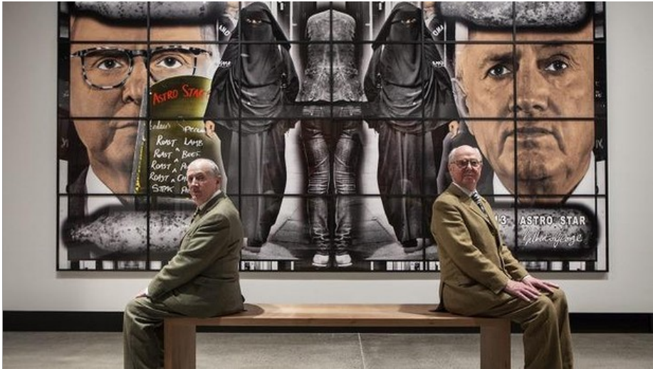
Back up in Australia: Gilbert & George, with a work from their 2013 Scapegoating Pictures series, at Hobart's Museum of Old and New Art.

Now they're presenting a 40-year retrospective of their work at the Museum of Old and New Art in Hobart, followed by a talk in Melbourne on Monday.