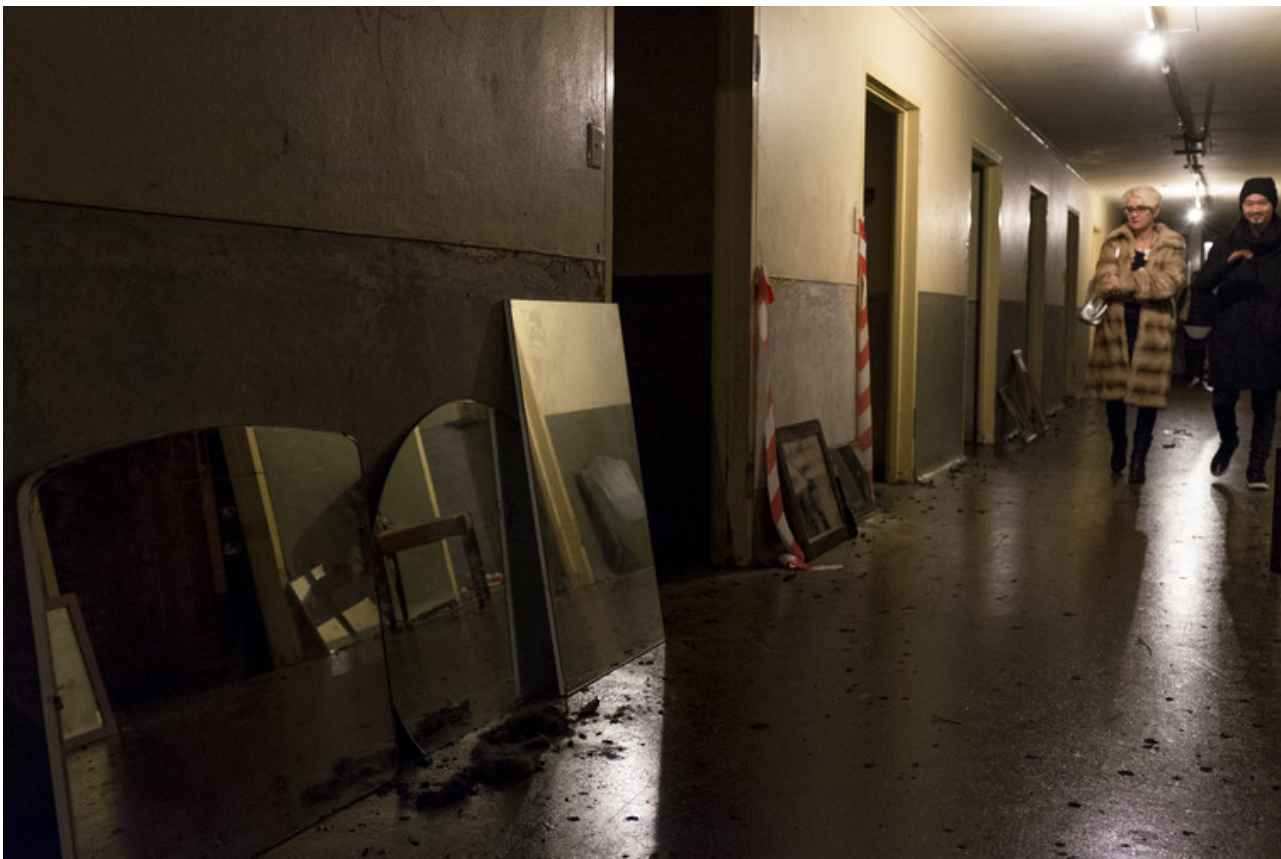
Mike Parr, Asylum.

In another building, there is a sea of pale green broken glass. We move on – a possum runs, terrified, through an empty hallway framed by the heavy doors to the old patient cells. There's a sense of unease, but it's somehow all too familiar, almost expected. Indeed, the experience reminds me of Parr's work installed at Cockatoo Island for the 2008 Sydney Biennale. At the time, it was a standout, resonating with me for days after the encounter. This time, the similarity almost bores me.