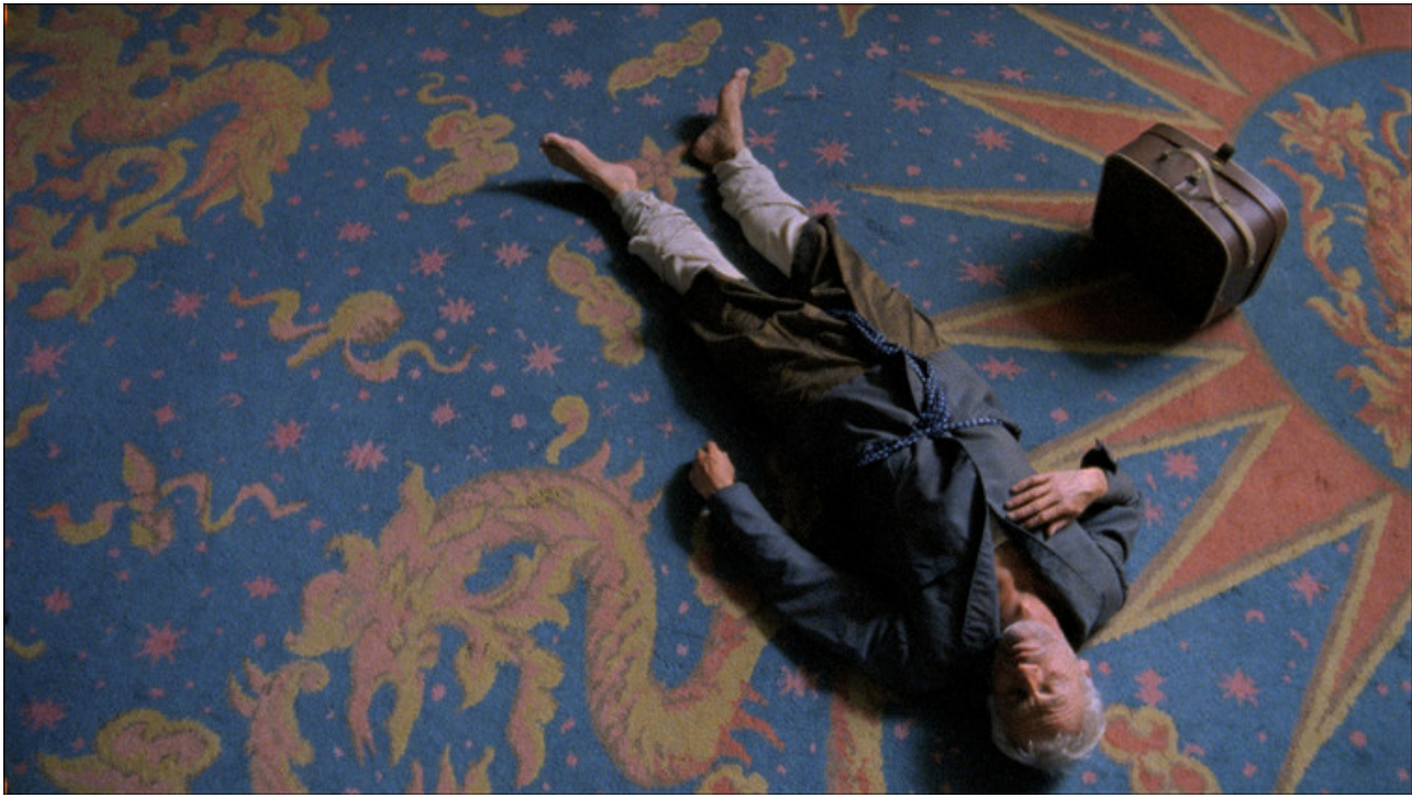
Fiona Tan, A Lapse of Memory .

From the still ships in harbour, we move into the storm. David Stephenson's Star Drawings conjure connections to navigation and destiny while on the opposite wall, a massive drawing of lightning, by Tacida Dean – When First I Raised the Tempest, No.17599 – extends the full length of the gallery. A series of paintings of ships, a love letter and a room-size painting of Prospero's Island extend the narrative.