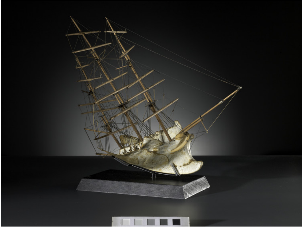
Ship Model, 1800s.

As we move into the exhibition, I start to note how expertly the journey has been crafted. The collections of artwork, objects and natural history specimens create a rich narrative linked to the perils and wonder of discovery and the story of The Tempest . We are about to set sail and the start to the journey is marked by Tacida Dean's video How to Put a Boat in a Bottle .