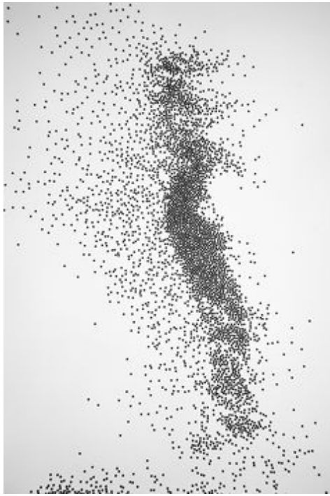
Ryoji Ikeda, Supersymmetry .

As though there is no god, just a series of computers, mapping and controlling the fate of every particle, creating patterns and systems that appear open, but follow distinct rules.