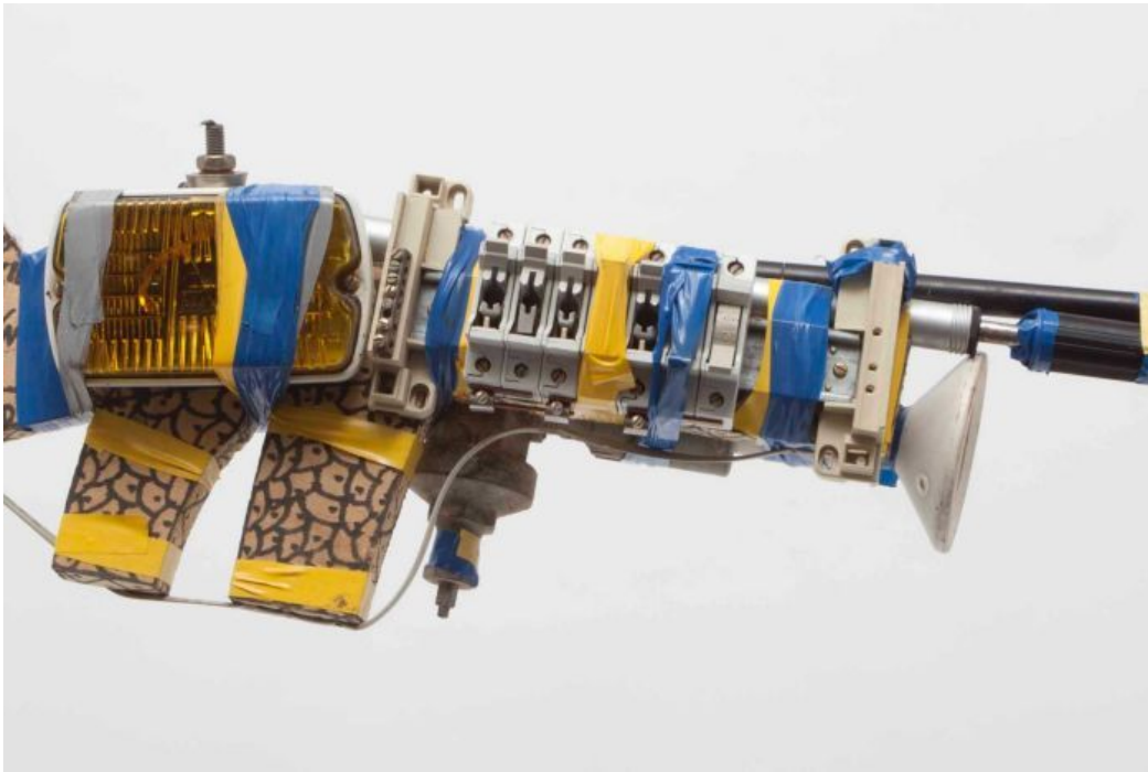
PHOTO: An untitled artwork from The Museum of Everything.

"What we hope is that that actually gives a legacy to Australia where the big museums start taking note that there is another contemporary art lurking under the surface of the mainstream."