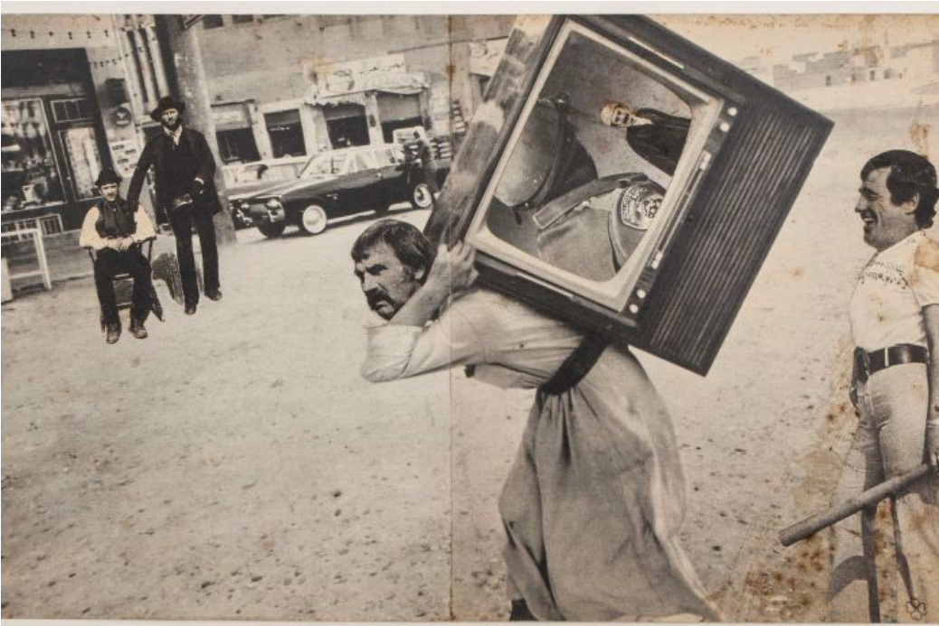
PHOTO: The work of Romanian artist Ion Birlădeanu is also featured at MONA.

"This is the first major show of non-academic, non-professional 'otherness' that Australia has ever had and that is pretty great."