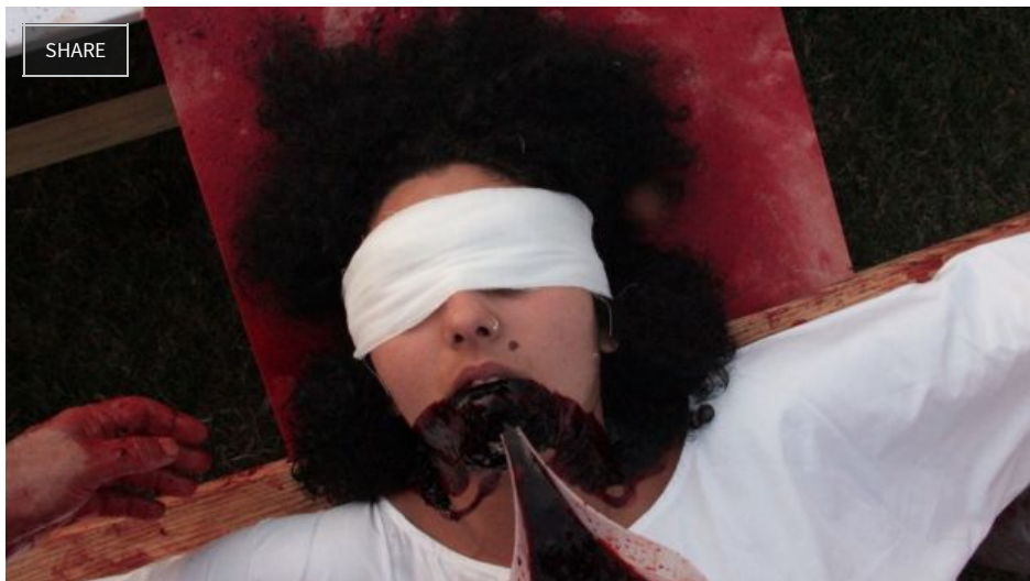
An image from the 2012 Hermann Nitsch work, 135.Action.

strong adult themes, and is not suitable for children".