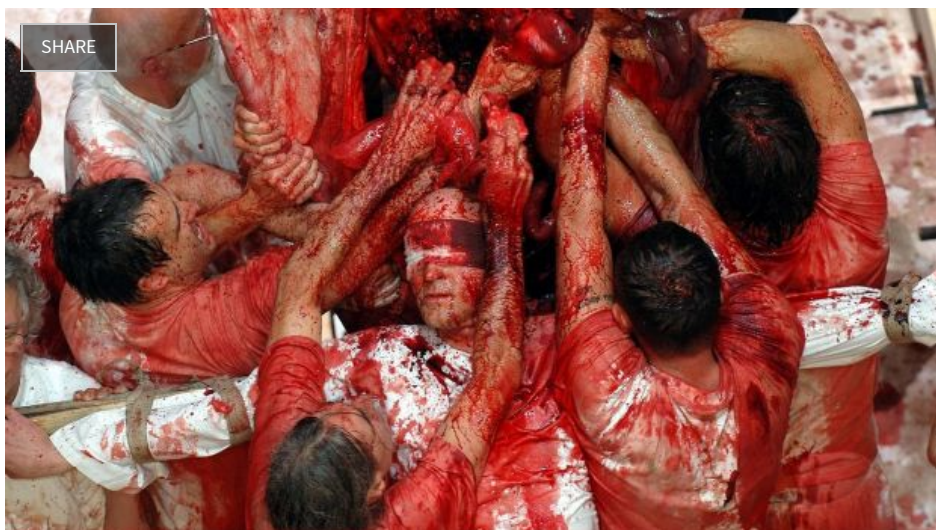
Hermann Nitsch's 122.Action at Burgtheater, 2005.

The artist would be using the carcass of a locally-sourced, humanely-killed animal that was already destined for the meat market, he said, along with some fish, fruit, blood, live performers and an orchestra.