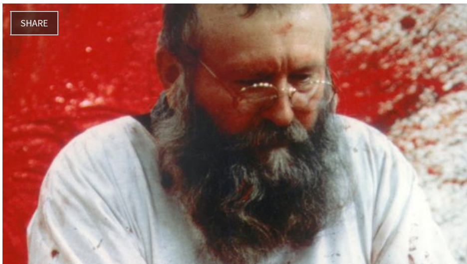
Austrian artist Hermann Nitsch has been using animal carcasses and blood in his art for decades.

Animal Liberation Tasmania slammed the Museum of Old and New Art (MONA), which organises the annual festival held over the winter solstice, for scheduling the programming art piece by Austrian artist Hermann Nitsch, who plans to use 500 litres of animal blood in the work.