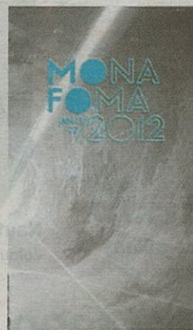
Your 56-page MONA FOMA program will appear in the Sunday Tasmanian tomorrow.