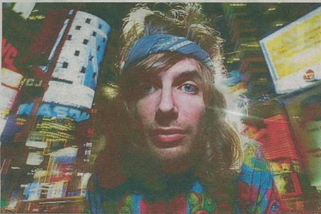
MASH-UP MASTER: Michael Gillis, aka Girl Talk.