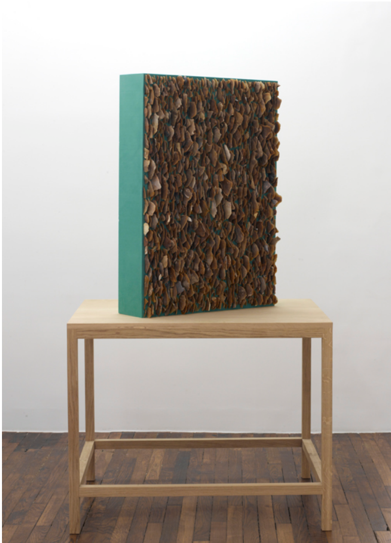
Hubert Duprat (Born 1957, Nérac, France; lives and works in southern France), Sans titre (Untitled) , 2013, Polyurethane foam and flints, Height 39 3/8 x length 27 1/2 x depth 7 1/8 inch. ADAGP, photoF.Gousset. Image