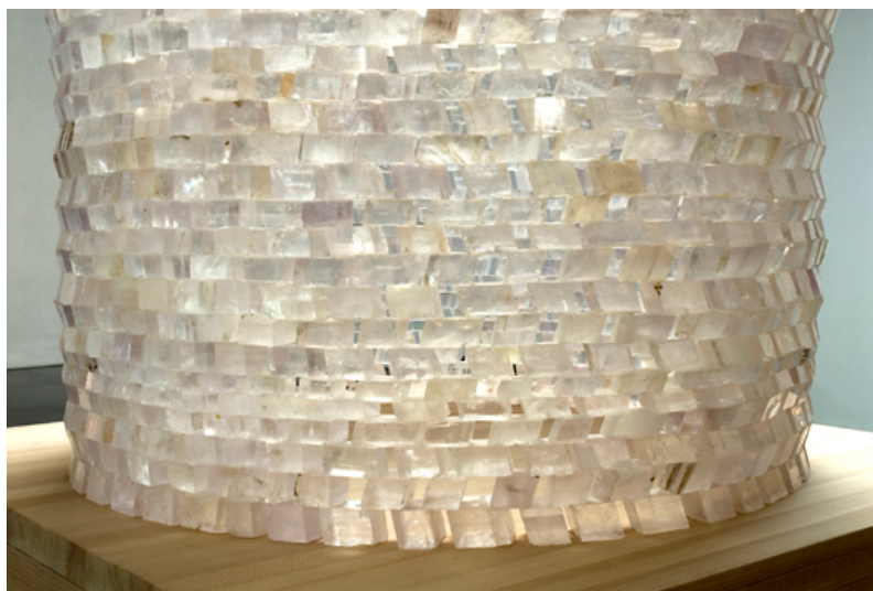
Hubert Duprat (Born 1957, Nérac, France; lives and works in southern France), Untitled , 2008, Calcite crystals, glue, Height 100cm, diameter 80 cm. Collection Frac Limousin, Limoges, ADAGP, photo F.Delpech. Image courtesy of the artist and MONA Museum of Old and New Art, Hobart, Tasmania, Australia.