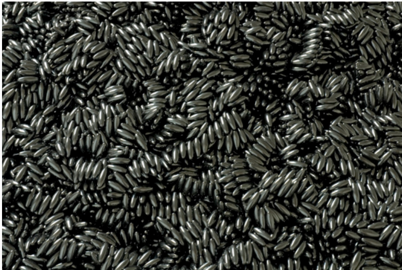
Hubert Duprat (Born 1957, Nérac, France; lives and works in southern France), Untitled , 2008, 200 000 magnetites, Height 85 cm, diameter 250 cm. Collection Centre National des Arts Plastiques, Paris, ADAGP