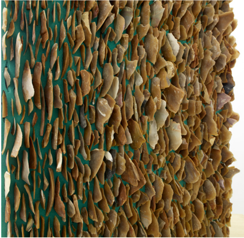
Hubert Duprat (Born 1957, Nérac, France; lives and works in southern France), Sans titre (Untitled) , 2013, Polyurethane foam and flints, height 39 3/8 x length 27 1/2 x depth 7 1/8 inch. ADAGP, PhotoF.Gousset. Image courtesy of Art : Concept, Paris and MONA Museum of Old and New Art, Tasmania Australia.