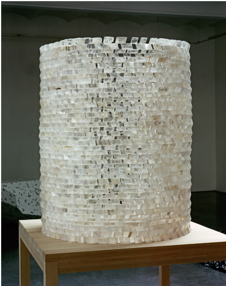
Hubert Duprat (Born 1957, Nérac, France; lives and works in southern France), Untitled , 2008, Calcite crystals, glue, Height 100cm, diameter 80 cm. Collection Frac Limousin, Limoges, ADAGP, photo F.Delpech. Image courtesy of the artist and MONA Museum of Old and New Art, Hobart, Tasmania, Australia.