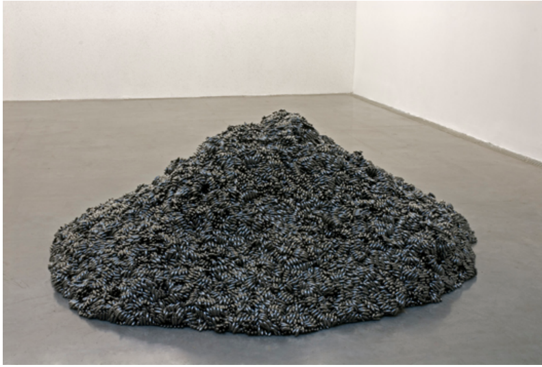
Hubert Duprat (Born 1957, Nérac, France; lives and works in southern France), Untitled , 2008, 200 000 magnetites, Height 85 cm, diameter 250 cm. Collection Centre National des Arts Plastiques, Paris, ADAGP, photo F. Delpech. Courtesy of the artist and MONA Museum of Old and New Art, Hobart, Tasmania, Australia.