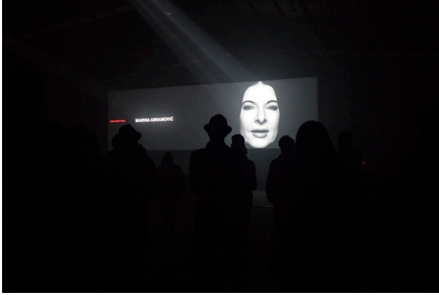
Marina Abramović: Private Archaeology, Dark Mofo 2015.