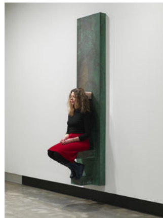
Red Dragon, Marina Abramović: Private Archaeology, Dark Mofo, 2015.

Counting the Rice asks the visitor to separate, count and record piles of rice and lentils in a search for stillness and peace. This work heralds a new focus for Abramović, where "rules of participation" are now central to the viewing experience.