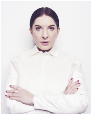
Marina Abramović: Private Archaeology, Dark Mofo 2015.

It provides the opportunity to partake in a personal excavation of Abramović's life, which not only reveals much about the artist – it forms a lasting sense of introspection for the spectator as well.