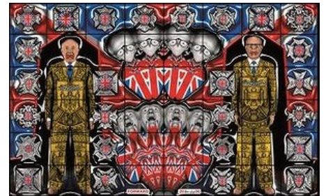
FORWARD, 2008 Gilbert & George Mixed media.

Correction: A previous version of this story stated this would be Gilbert & George's debut in Australia. In fact, Gilbert & George appeared as part of the Kaldor Public Art Project in 1973.